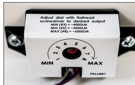
For ALO6 configurations